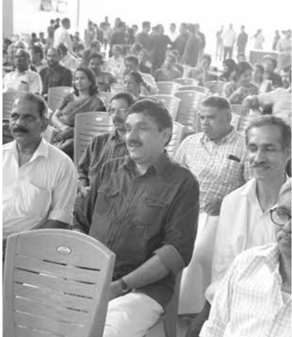
Deva Sangamam 2018-19