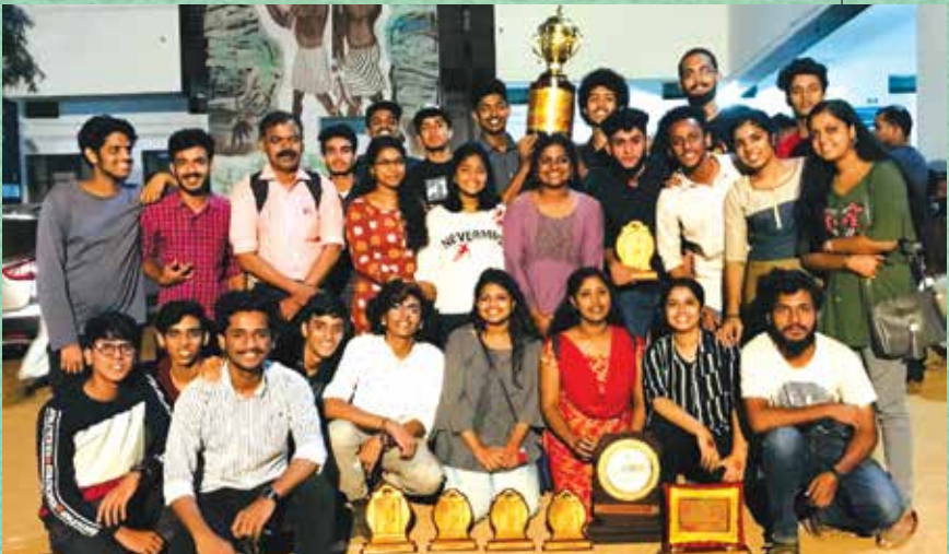
The B-Zone Champions & Inter Zone 1st Runner up 2018-19