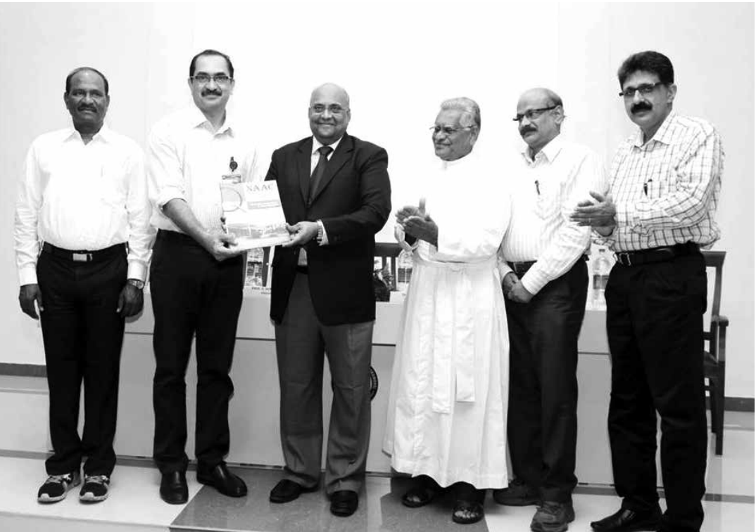
NAAC Exit Meeting