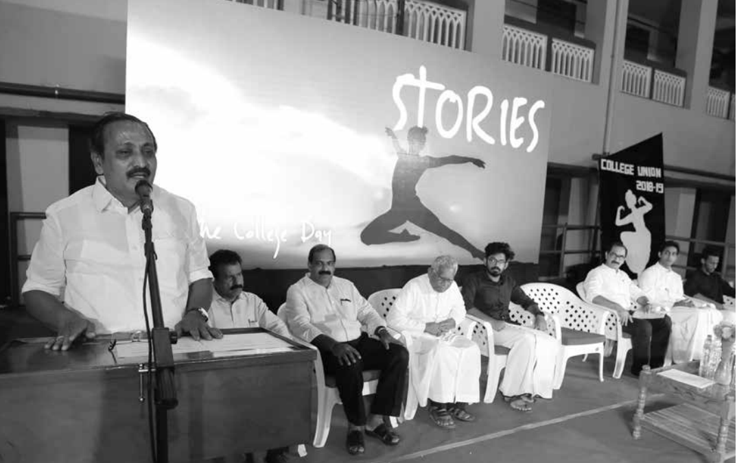
Stories- The College Day Celebrations 2018-19