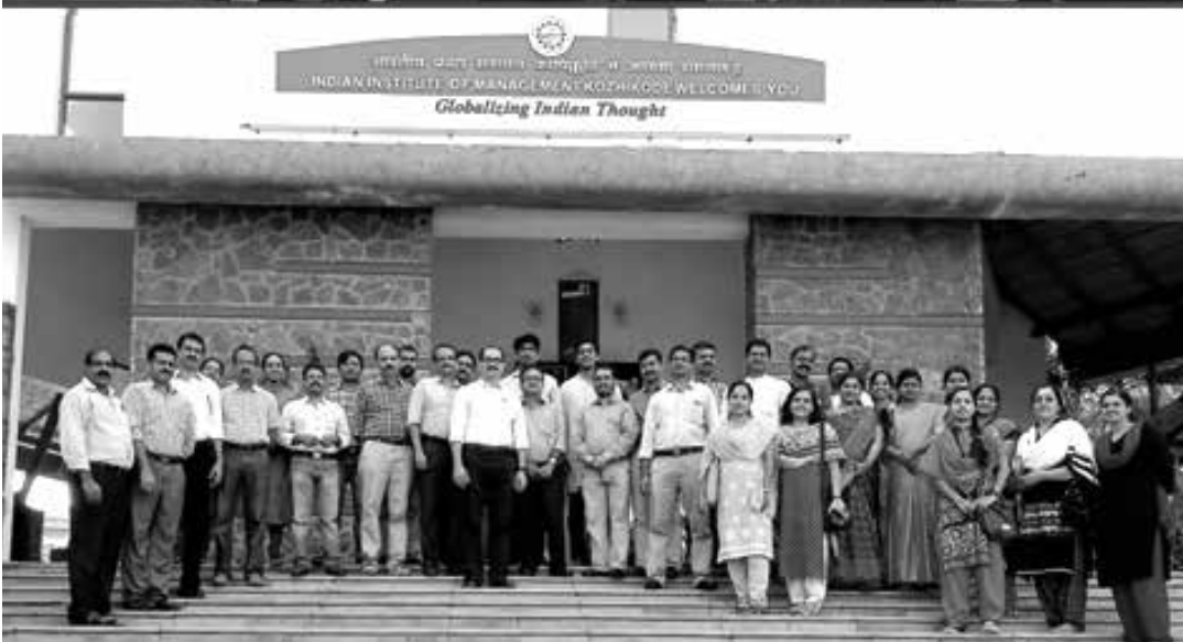
Training class for the faculty at IIM Kozhikode on 4-1-2019

cadets obtaining the certificate are eligible for grace marks in University examinations. They are also awarded bonus marks - 15 marks for degree programmes and 5 marks for PG programmes at the time of admission.