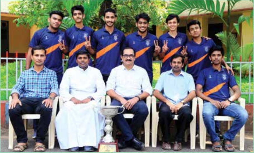
Champions: Calicut University Shuttle Badminton 2018-19