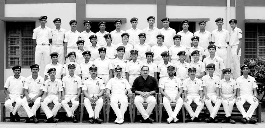
NCC Naval Wing- St. Joseph's College (Autonomous), Devagiri