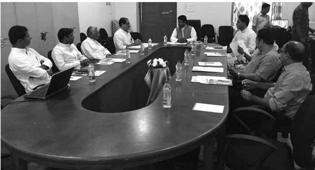
Governing Body Meeting