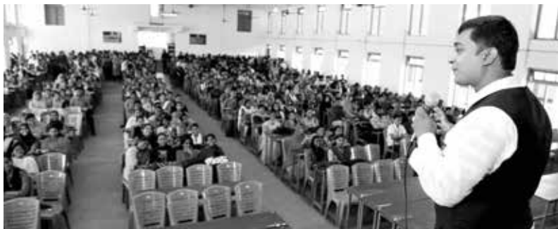
Value education class for the students on 4-1-2019

In memory of the College Golden Jubilee Celebrations an insurance scheme known as "Devagiri College Golden Jubilee Insurance Scheme" was instituted by the College PTA. A student is eligible for the benefits of this scheme from the moment he/ she gets enrolled as a student of this college. If a student dies (by accident/disease) while he/she is a student, his/her family will get an insurance amount of Rs.30,000. If