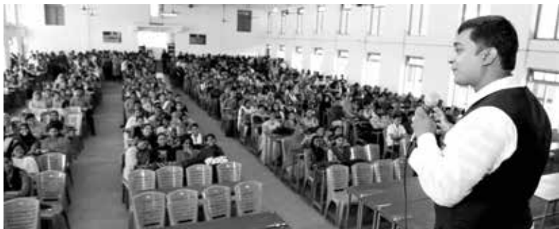
Value education class for the students on 4-1-2019

In memory of the College Golden Jubilee Celebrations an insurance scheme known as "Devagiri College Golden Jubilee Insurance Scheme" was instituted by the College PTA. A student is eligible for the benefits of this scheme from the moment he/ she gets enrolled as a student of this college. If a student dies (by accident/disease) while he/she is a student, his/her family will get an insurance amount of Rs.30,000. If