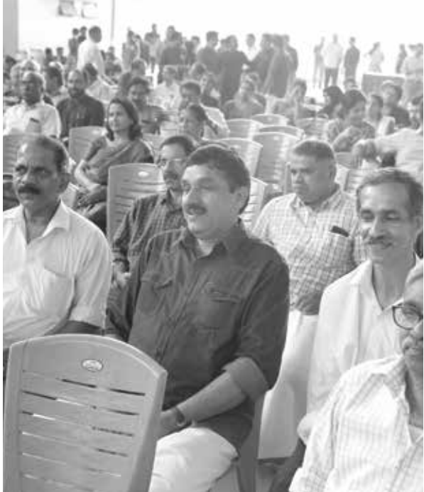
Deva Sangamam 2018-19